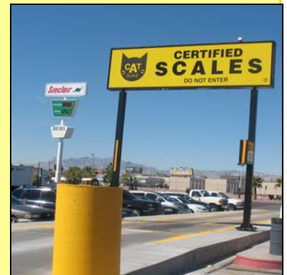
Wild Wild West Truck Plaza— Las Vegas, Nevada

Whether you are in a Big Rig, RV, driving a small car, or anything in between, stop by Wild Wild West Truck Plaza in Las Vegas. You will love the hospitality, selection, and amenities!! Wild Wild West Truck Plaza and Las Vegas... now the West has it all.