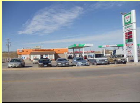
Pine Bluffs Sinclair—Pine Bluffs, Wyoming

As you are traveling across Interstate 80 this summer be sure to stop at Pine Bluffs Sinclair; it is the perfect place to re-fuel and rest before